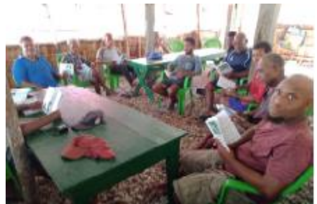
Training session in the use of the Lau Family Bible Storybooks